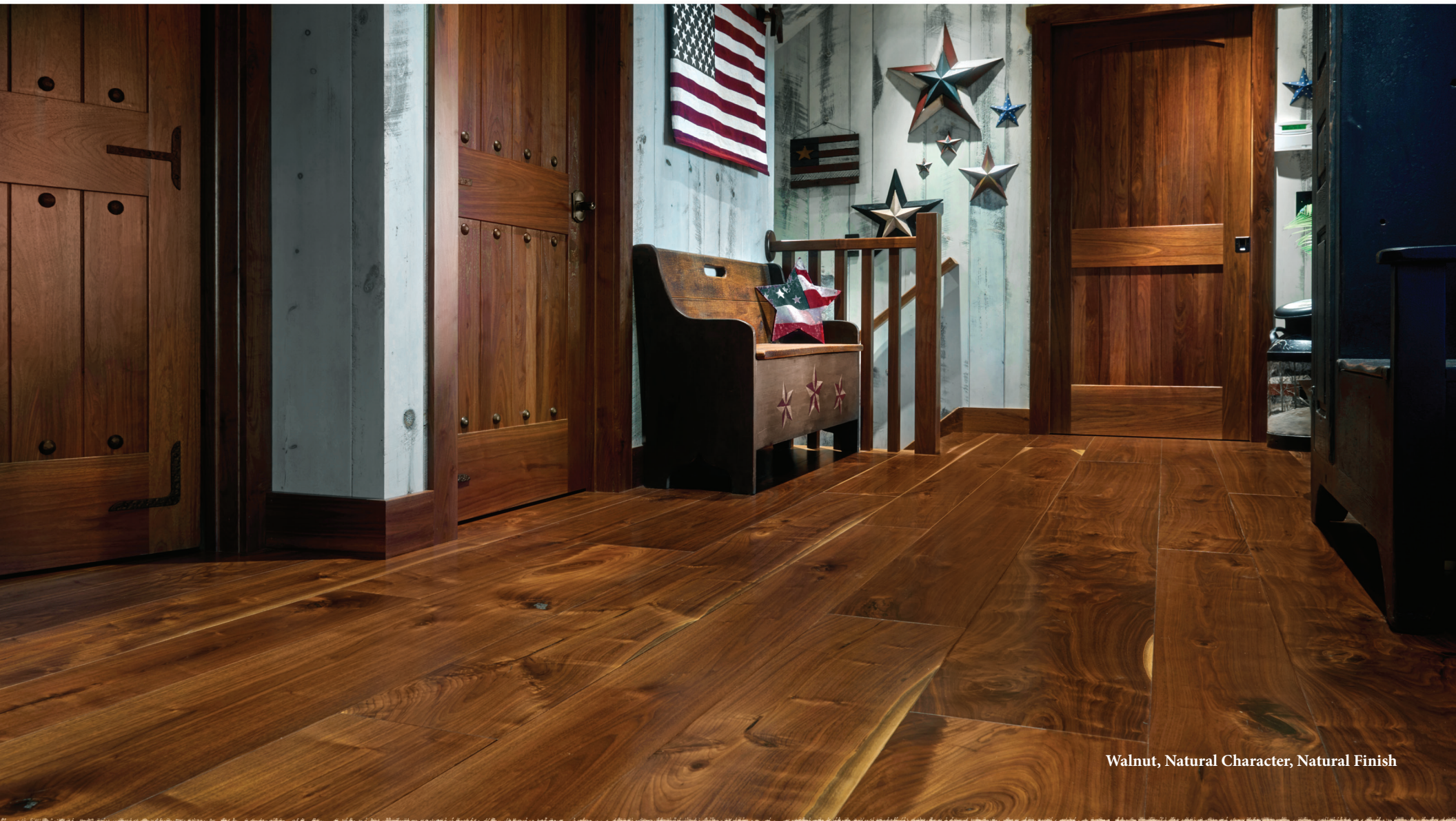
Walnut, Natural Character, Natural Finish