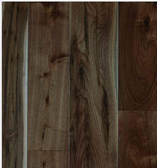
Natural Character, Natural Finish

Northern Black Walnut has grain that is mostly straight and open, with some boards featuring a burlled or curly grain. It is highly sought after for its deep, rich, almost black or purple color unique to the species that creates an elegant floor for a timeless, contemporary look.